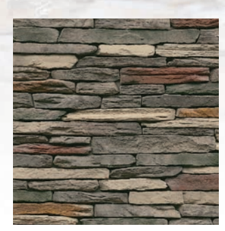
Tennessee Laurel Cavern Ledge