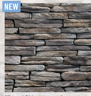
Mineral Ridge™ Laurel Cavern Ledge