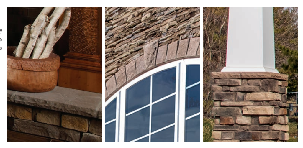
Keystone & Trim Stones in Espresso Flagstone Wall Cap in Espresso