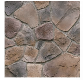
Valley Forge Fieldstone