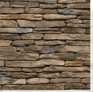
Asher Laurel Cavern Ledge