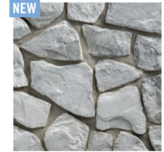
Silver Summit™ Fieldstone