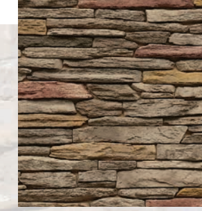
Chardonnay Laurel Cavern Ledge