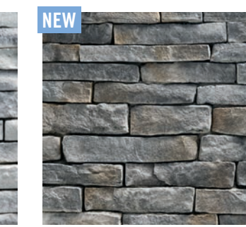
Silver Summit™ Ledgestone