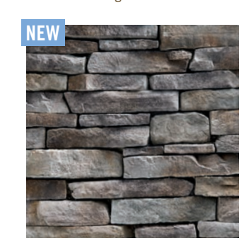
Mineral Ridge™ Ledgestone