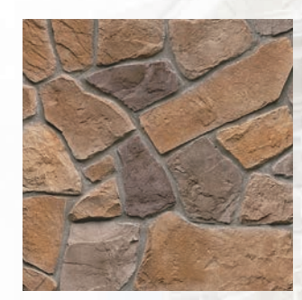
Warm Springs Fieldstone

The sandstone textured profile Cobble is roughly chisel-cut into rectangular ashlar shapes. To soften the rugged appearance, the edges are slightly weather worn. Subtle face texture and unique beveling encourage the individuality of each stone.