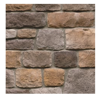
Warm Springs Heritage