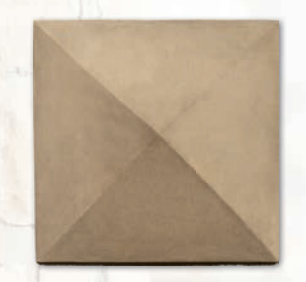
Pier Cap 26"w \times 26"L \times 2.5"-5.5"H